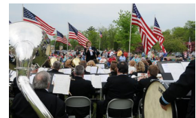
Memorial Day 2011

In addition to the Wednesday evening concerts, the group performs for the annual Merrill Memorial Day service, the Tomahawk Pow Wow Days parade on July 4th, and the Merrill Labor Day parade. The band also traveled to the Madison state capitol in 1994 to perform at the Community Band Festival.