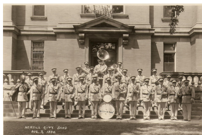
The Merrill City Band - August 3, 1930